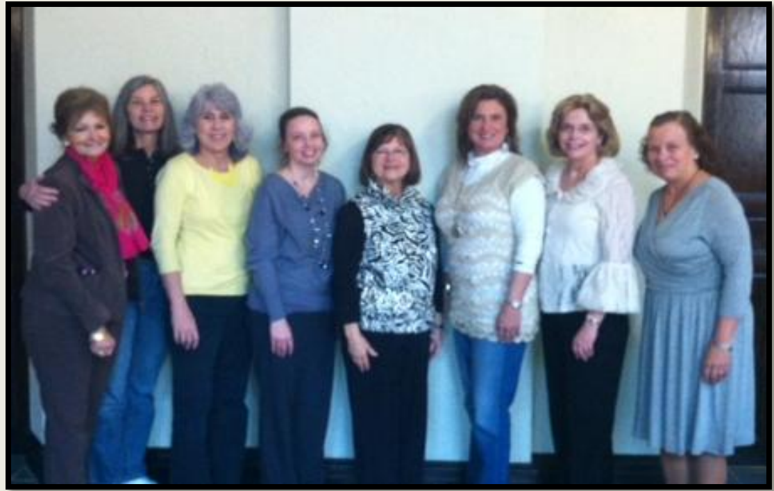
SCAPT Board of Directors